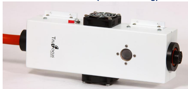
Packaged in a metal housing with FAN